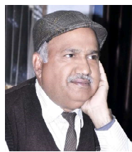
By: Vijay GarG

A solid Film Studies course seeks a strategic balance between theory and practice.