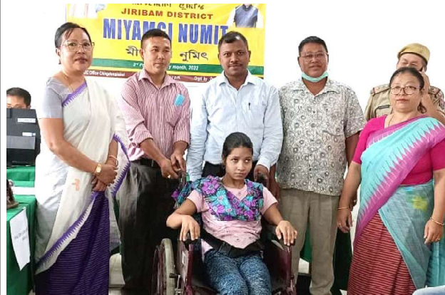
IT News Jiribam, Sept 16:

To achieve the State Government's objective to make Government citizen centric, proactive and programme implementation effective, the District Administration of Jiribam organised 3rd Meeyamgi Numit and Hill Leaders' Day today at Chingdong Leikai, DC Complex Jiribam.