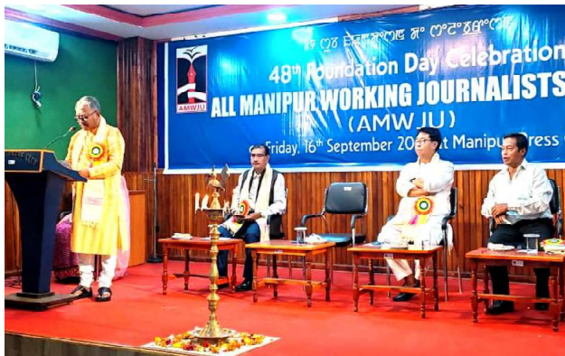
IT News Imphal Sept 16:

The All Manipur Working Journalists' Union (AMWJU) today observed the 48th Foundation Day at Manipur Press Club here in Imphal.