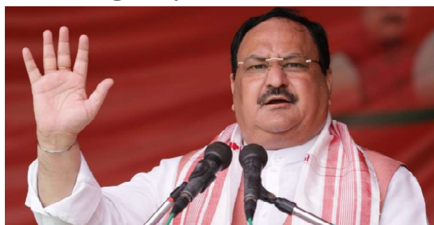
Agency Kohima, Sept 16:

The northeast has now become insurgency-free with the signing of various accords with militant groups of the region in the last few years, BJP national president J.P. Nadda said on Thursday. Addressing a party rally at Old Riphym Village, Nadda also said the Centre's goal is to resolve all disputes of the northeast.